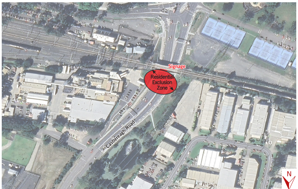
Image: Light Model - Plan showing residential exclusion zone.

“Residential Exclusion Zone” is defined as the region in which the illuminance levels to residential properties would exceed the maximum allowable under the Zone limits in AS4282. If no residential properties are located within the Exclusion Zone then the signage will comply with the illuminance limits in the Standard.